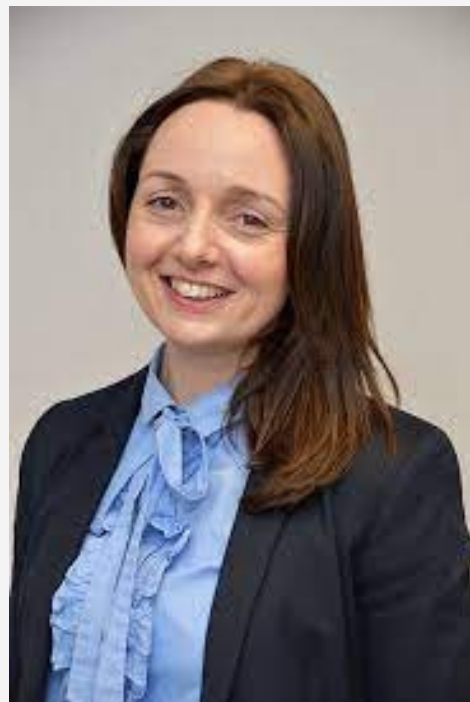
Llinos Medi Council Leader

As we progress to a stage where we learn to live a life alongside COVID 19, I'd like to pay my thanks for all the work that's happened over the past 18 months which was undertaken under such difficult circumstances. The challenges remain, but together we can make a difference and by pulling together we can show the strength of our small island."